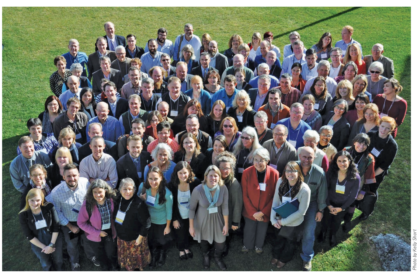
Northern Forest Regional Symposium leaders gather on the front lawn of the OMNI Mount Washington Resort in Bretton Woods, NH. The event focused on connecting communities, economy and landscape by building relationships and examining success stories across the region.

The 2015 Symposium Planning Committee Members included: