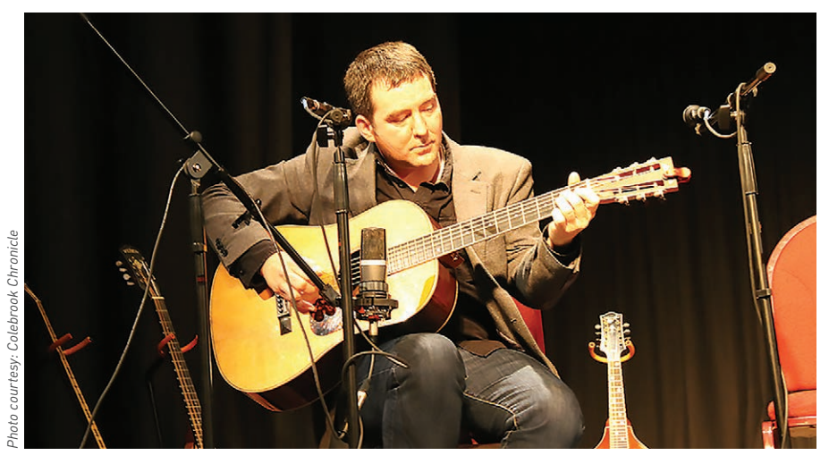
The Great North Woods Committee for the Arts brought the award-winning Cape Breton band Còig to the Tillotson Center in Colebrook, NH. The five-member band played new and traditional holiday music to a sold-out crowd.