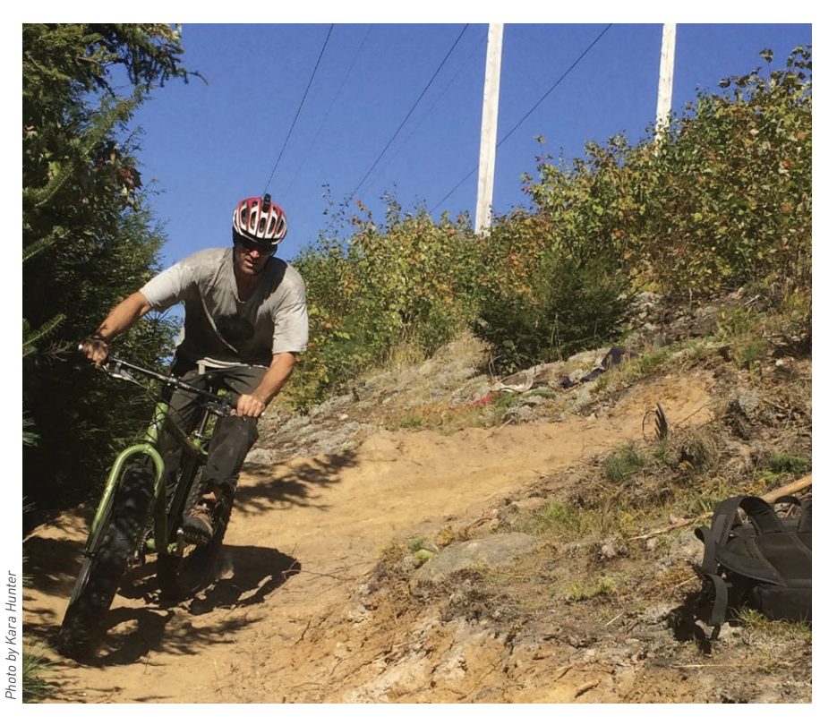
A biker tests the new single-track trail near the "River Road" section in Gorham, NH. In coordination with the Gorham Land Company, Coös Cycling Club volunteers designed, constructed, and provided signage for mountain bikers, runners and hikers.

For general operating support to pursue forest- and energy-related initiatives benefiting Coös County and surrounding communities. $75.000